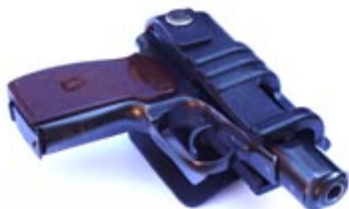
EFA-2K quick-response holster (9mm Makarov (PM) / IZH-71 / IZH79-9T / PM-654K)